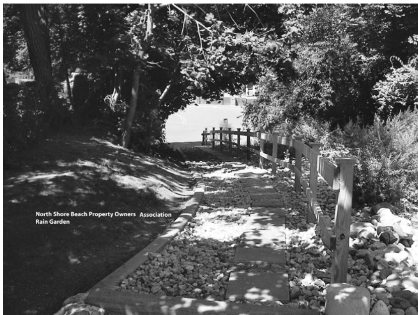
NSBPOA Rain Garden